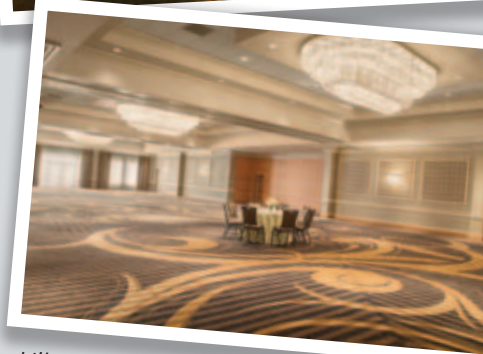
Hilton Akron/Fairlawn and the newly renovated ballroom